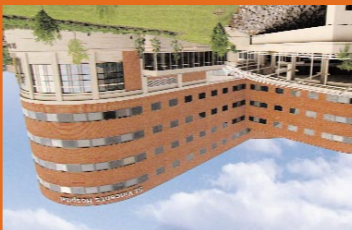
St. Vincent's Hospital

www.bellsouth.com/business/wirelesshospital